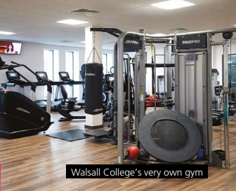
Walsall College's very own gym