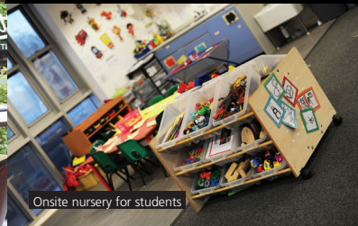
Onsite nursery for students