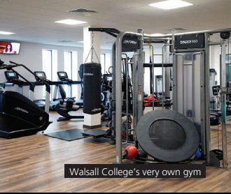
Walsall College's very own gym