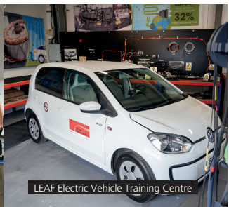
LEAF Electric Vehicle Training Centre