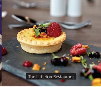
The Littleton Restaurant