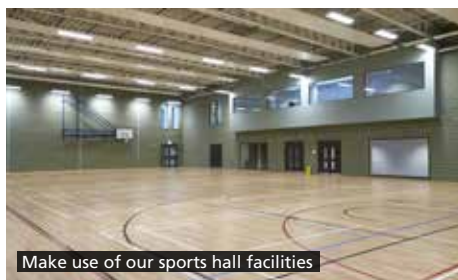
Make use of our sports hall facilities