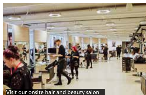
Visit our onsite hair and beauty salon