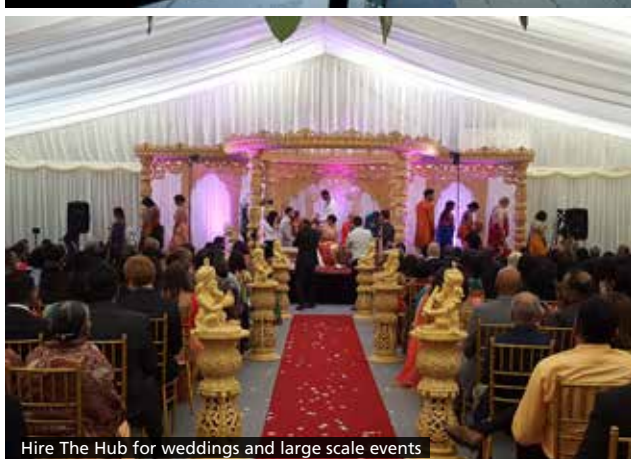
Hire The Hub for weddings and large scale events