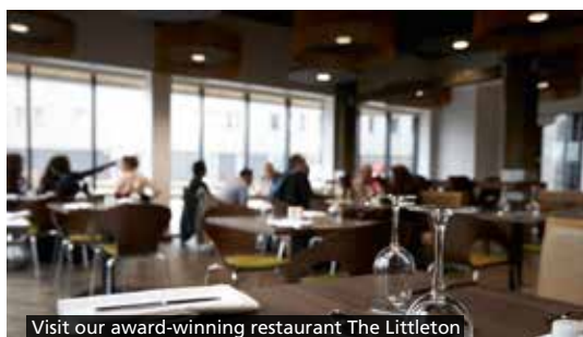
Visit our award-winning restaurant The Littleton