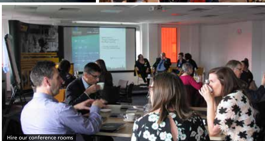
Hire our conference rooms